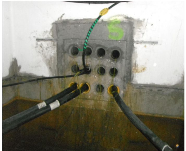
Fibre in duct sample